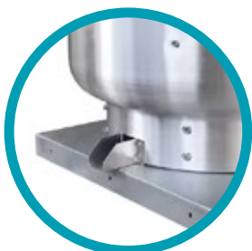
◦ Drain tube for easy removal of fluids (water and fat).