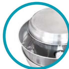
◦ Housing specially designed to protect the equipment from the entry of rain and a protective grid against the entry of objects.