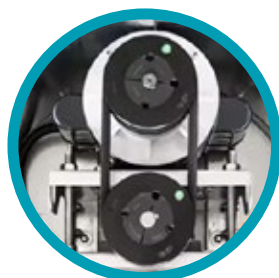
◦ Belt-driven assembly